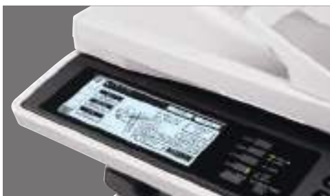
The optional Super G3 Fax module provides high-speed facsimile functions in a powerful LAN environment.

The Super G3 Fax Module also provides powerful LAN faxing allowing you to send a fax right from your desktop PC! With an intuitive user interface, sending a fax from your desktop is as easy as printing—just select SEND and you're done!