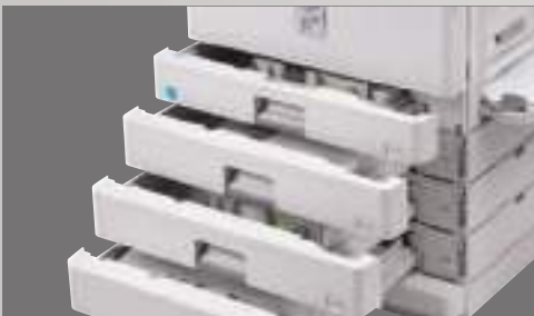
On-line paper capacity stores up to 2,100 sheets with options.

For even more performance and functionality, Sharp's optional Print Controller with PCL® 6 compatibility and embedded networking provides 64 MB standard memory, 1200 x 600 dpi (enhanced) resolution and 10/100 baseT networking for ultra-crisp network printing right from the convenience of your desktop. Features such as Carbon Copy Print mode, cover pages, proof printing and optional form/font downloads, enable you to produce professional, high-quality documents.