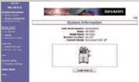
Embedded Web Page.