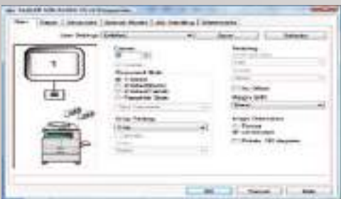
Increase network printing functionality and performance with Sharp's PCL6-compatible optional Print Controller.