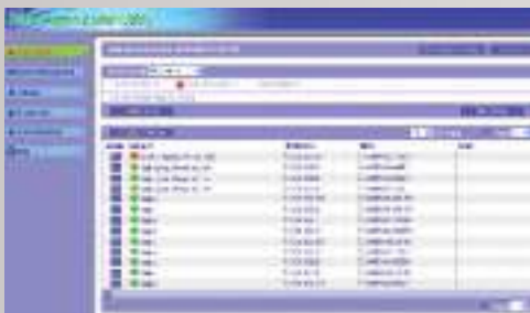
Printer Administration Utility.

Convenient Document Management at Your Command — Powerful. Flexible. Intuitive. Designed to work seamlessly across Sharp's entire line of document imaging systems, Sharpdesk software enables you to integrate scanned documents into your daily workflow. The user-friendly interface allows you to view document thumbnails in over 200 file formats. Advanced features help you organize, edit—even combine scanned files—for maximum productivity.