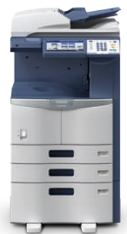
e-STUDIO456 with 2,000-Sheet LCF.