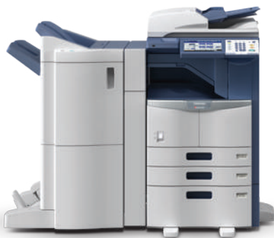
e-STUDIO456 with 2,000-Sheet LCF, Hole Punch, and Saddle-Stitch Finisher.