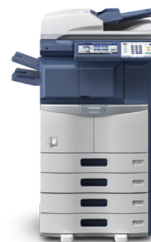
e-STUDIO456 with 50-Sheet Inner Finisher and Hole Punch.