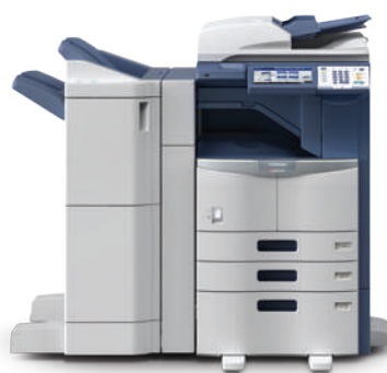
e-STUDIO456 with 2,000-Sheet LCF, Hole Punch, and 50-Sheet Staple Console Finisher.