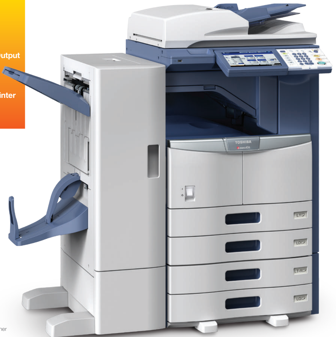
e-STUDIO456 with Saddle-Stitch Finisher