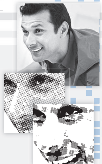
Superior image quality.

Speed is only valuable when the product remains high-quality. That's why Toshiba ensures image quality with a crisp, clear 2400 x 600 dpi using an advanced image processor unit. Ultra-fine 8-micron toner and 40-micron developer also help keep images crisp, offering exceptionally fine resolution. An 8-bit monochrome scanner produces precise grayscales while sharpening onscreen images.